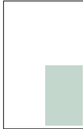
Quarter Page 5”w X 8”h $60